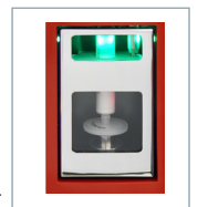
More than 50ppm